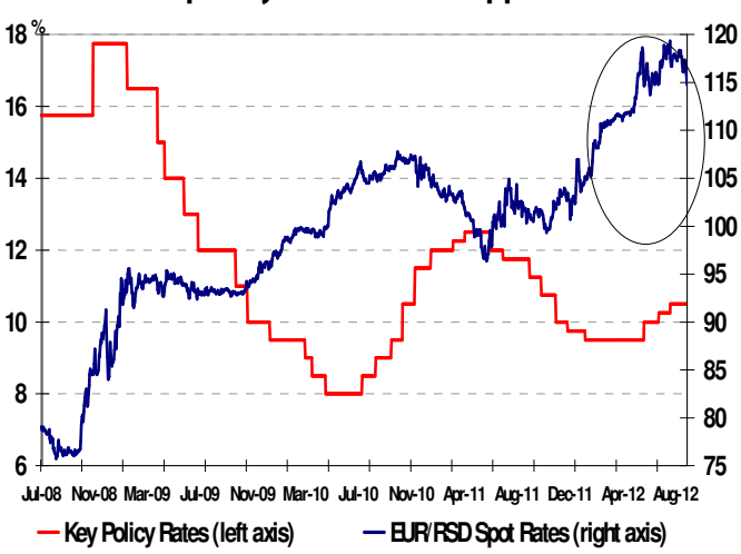
Figure 1 Dinar recovered only modestly vs. € in mid September helped by increased risk appetite

The reaction of the FX market to the new package is relatively muted. Dinar has recovered modestly from its historic lows in line with its regional peers helped by the latest ECB decisions. However, it is going to take a committed effort towards fiscal consolidation and an improvement in the macroeconomic environment before a change in the depreciation trend takes place. Dinar depreciated as much as 118.92/€ on July 25th, only to strengthen a bit to 115.4/€ (-12.7% year to date, -9.1% year on year). (Figure 1)